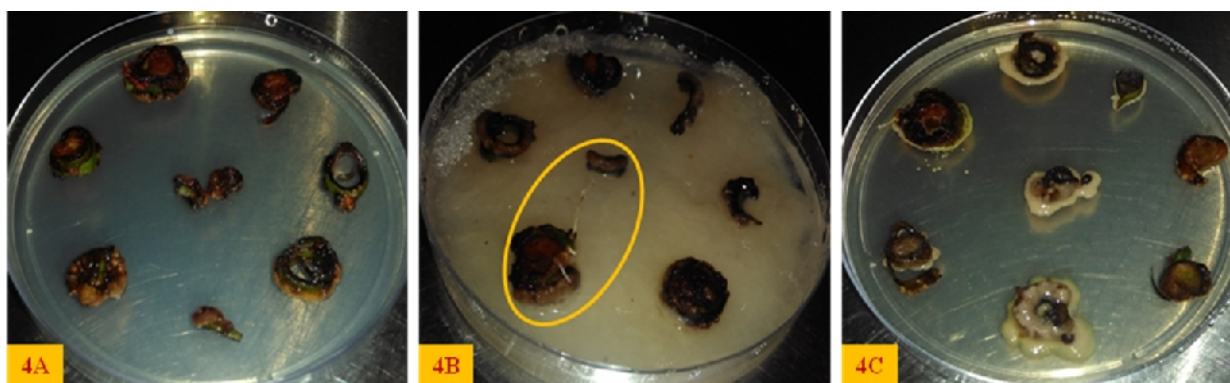
Fig. 4. Shoot induction, bacterial elimination and overgrowth of Agrobacteria at different mode of treated co-cultivated explants. (A). Solid MS-SI2 media containing 500mg/l cefotaxime, Agrobacteria absent and shoot induction very slow; (B). Cotton bed with liquid MS-SI2 media without cefotaxime, Agrobacteria not appears and shoot induction very fast (C). Solid MS-SI2 media without cefotaxime, Agrobacteria appear and killed the co-cultivated somatic embryogenic calli.