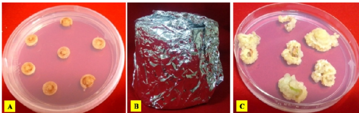
Fig. 1. Callus induction process (A). Inoculated leaf disc on MS+30mg/l sucrose+3mg/l 2,4-D (B). Wrapped leaf disc in aluminum foil for proper darkness (C). Appeared calluses in pretreated leaf disc explants.

explants. (Fig. 1). Mayerni et al. , (2020) also reported 2,4-D alone or together with BAP given better result for the formation of callus induction. During the embryogenic calli formation there was various types of calluses seen that was differ on the basis of color and texture. (I) Dense callus- In 3-4 weeks, milky, solid and compact like structure was appeared, that was further produce somatic embryo like structure. On a later stage, it produces purple color and do confirm the right way for the development of embryogenic calli (Fig. 2).