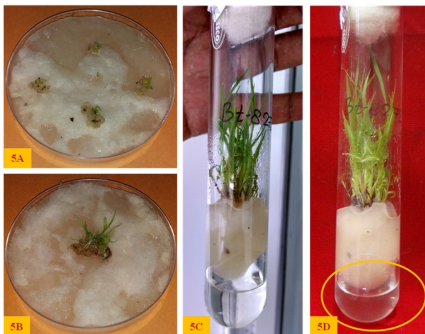
Fig. 5. (A&B). Co-cultivated healthy embryogenic calli on regeneration media with cotton bed (C). 1 st day Clean and transparent half MS medium and root were absent; (D). Loosing transparency of half MS media and roots present due to the detachment of Agrobacterium from plants in cotton bed and healthy roots were appeared.

medium via pores of cotton and Agrobacterium get settle down through this pores in medium to consume their food. The final result of this cotton bed during Agrobacterium mediated genetic transformation, both bacteria and plantlets get free from each other and plant survival efficiency get increased. This finding could be an efficient protocol for suppressing Agrobacterium tumefaciens without using any antibiotics in further genetic transformation or another works of sugarcane. This report might be a first report to eliminate Agrobacterium tumefaciens with the help of cotton bed so far.